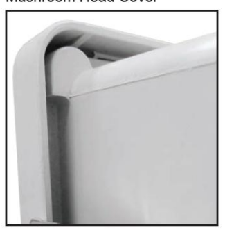
Ribbed Cover Corners