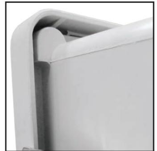
Ribbed Cover Corners